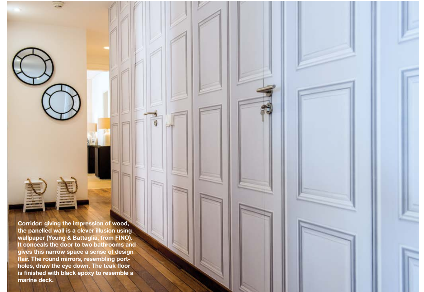
Corridor: giving the impression of wood, the panelled wall is a clever illusion using wallpaper (Young & Battaglia, from FINO). It conceals the door to two bathrooms and gives this narrow space a sense of design flair. The round mirrors, resembling port-holes, draw the eye down. The teak floor is finished with black epoxy to resemble a marine deck.

Paneling is also used to great effect on the walls in the corridor, cleverly breaking up what would otherwise have been an expanse of plain wall, and giving what is often a dull space its own character and flair. Here, though, it is not hard materials but a wallpaper inspired by traditional architectural detailing that creates the stylish look. In the bedrooms themselves, lightly ►