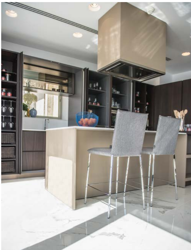
Kitchen: The kitchen by Varenna/Poliform, available exclusively from onepercent, cleverly conceals the appliances and sink behind multiple pull-out doors in a spessart oak wood finish. The island and Varenna kitchen hood are finished in a beautiful Castoro matt lacquer that contrasts the wood finish of the surrounding kitchen.