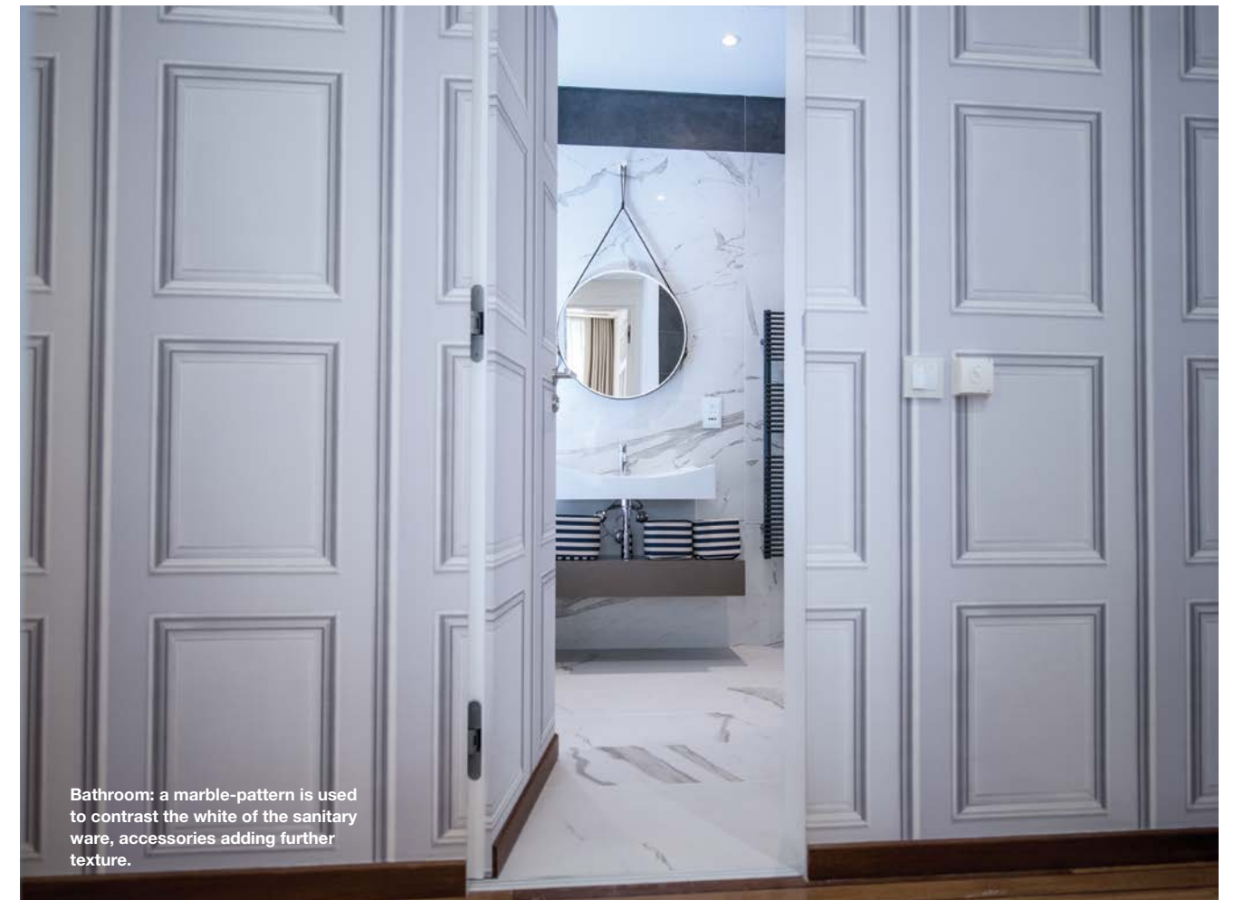
Bathroom: a marble-pattern is used to contrast the white of the sanitary ware, accessories adding further texture.